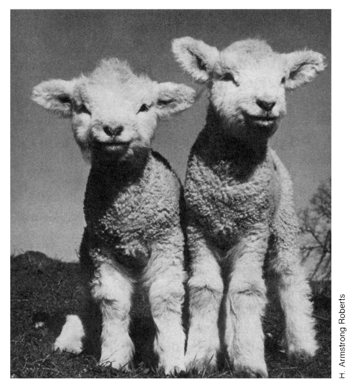
The Israelites were to slay a young lamb and smear its blood on the doorposts of their houses.

But each time, Pharaoh refused to free the children of Israel. One by one the plagues afflicted Egypt. Each plague brought greater destruction than the one before. Egypt was quickly becoming a ruined nation.