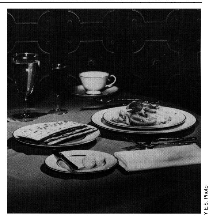
Unleavened bread, symbolic of the broken body of Christ. It is because of His brutal death that we can be healed.

A blemish is a flaw or fault. The "Lamb of God" was perfect—without sin or fault. The